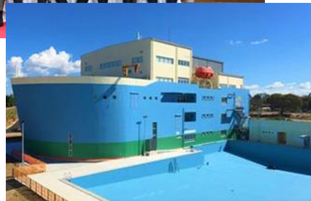
MOL Magsaysay Maritime Academy Inc. "Ship in Campus"