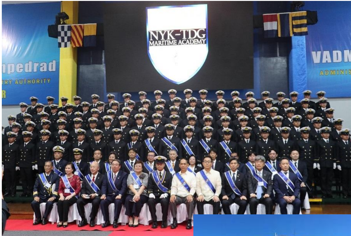
Graduation Ceremony at NYK's Maritime Academy in 2022